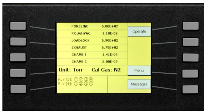
Six gauge display