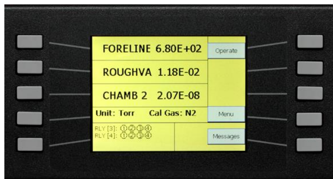
Three gauge display