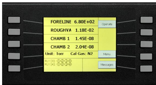
Four gauge display