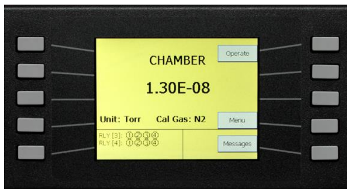
One gauge display - auto scroll one gauge at a time